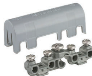
For Solid or Stranded Conductors RACO RACIBB