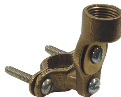
For 1/2" and 3/4" Rigid Conduit RACO 2512, 2522 and 2513